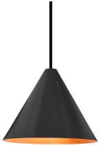
black painted M5749