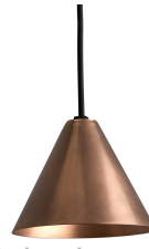
polished copper M5580