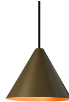
brown painted M5752