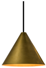
raw brass M5690