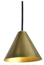
polished brass M5579