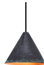
darkly patinated M5757