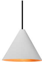
white painted M5750