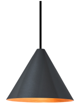
steel painted M5754