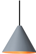
silver painted M5751