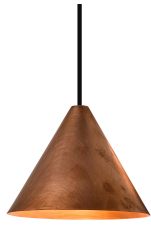
raw copper M5691