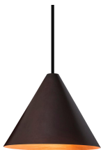
brown patina M5755