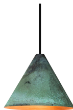
verdigris patina M5756