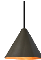
bronze painted M5753