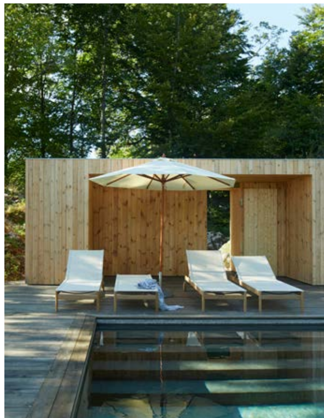
Pelagus Sunbeds in teak and Sling fabric