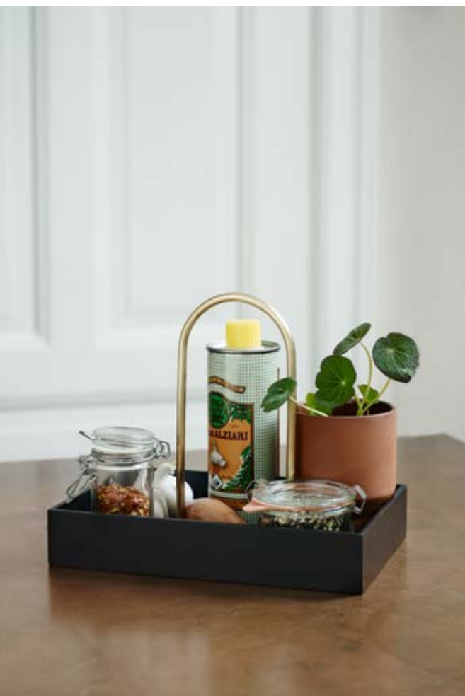
Norr Carrier in black oak