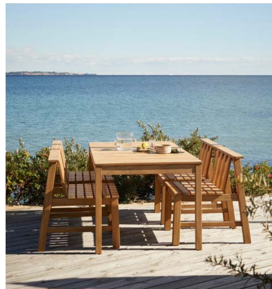
Plank Chair and Table in teak