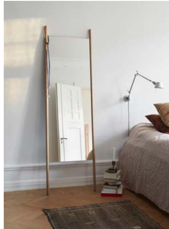
Georg Mirror in oak