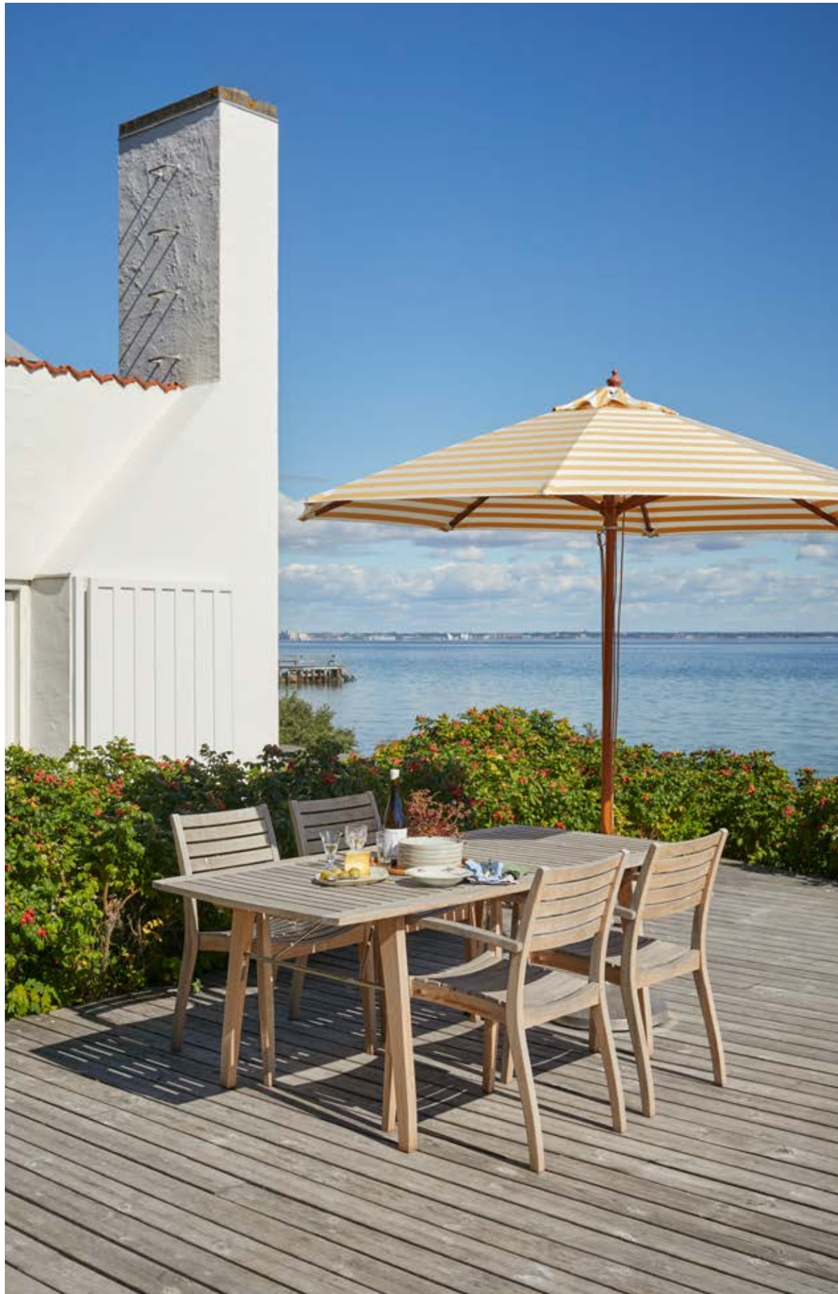
Messina Umbrella in kapur, and Ballare Armchair and Table in teak