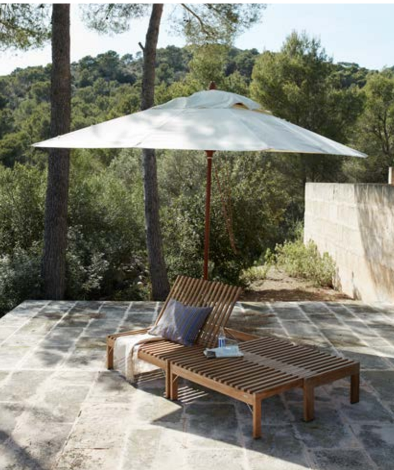
Riviera Lounge in teak and Messina Umbrella