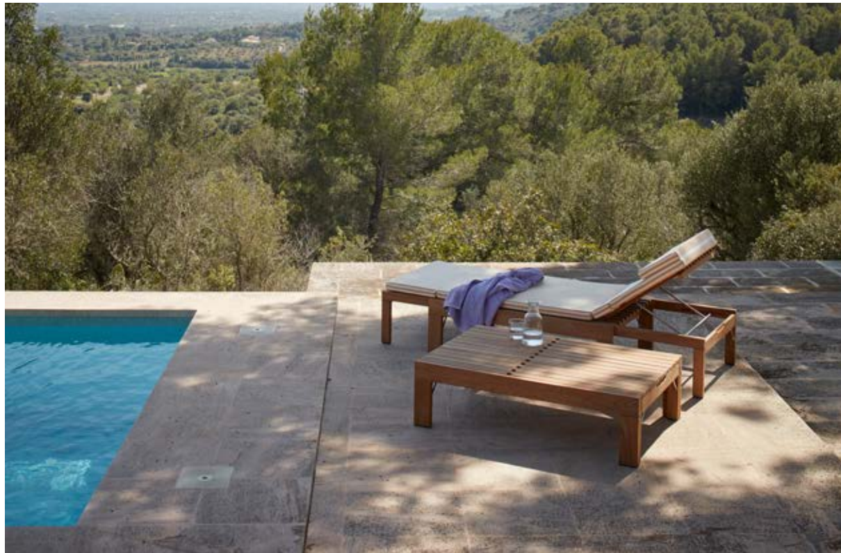
Riviera Sunbed in teak