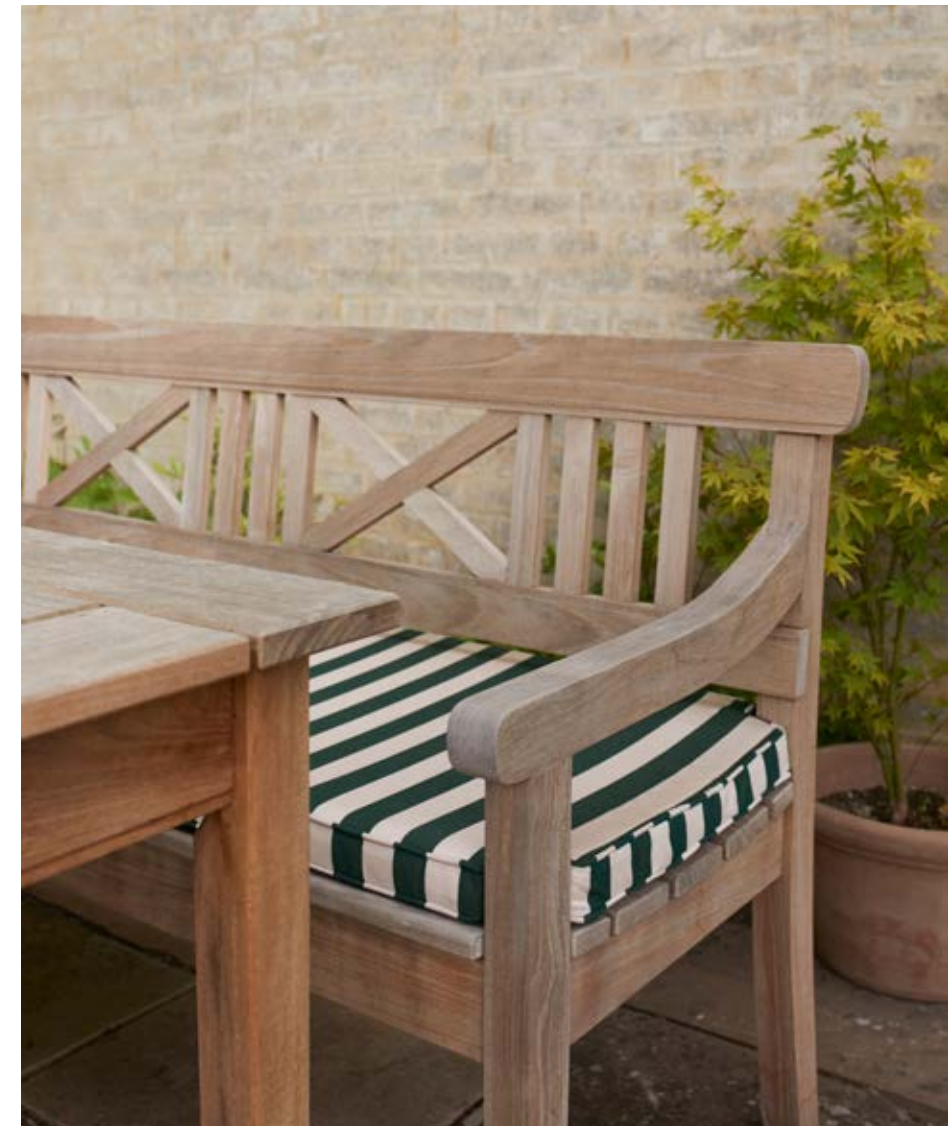
Drachmann Bench in teak with Cushion in Agora Lines fabric

The signature Drachmann series draws inspiration from the beautiful garden of Danish romantic poet and painter, Holger Drachmann. A careful balance of Nordic nostalgia and modern simplicity underlies its enduring popularity.