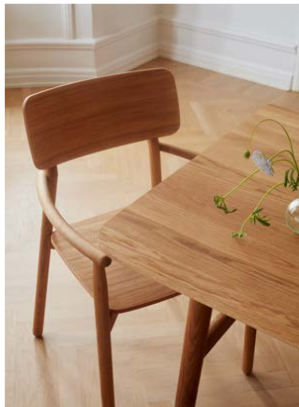
Hven Armchair in oak