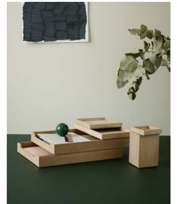
Nomad Letter Tray, Pen Holder and Trays in oak

Accessories and personal objects are the details that can transform any interior into a home.