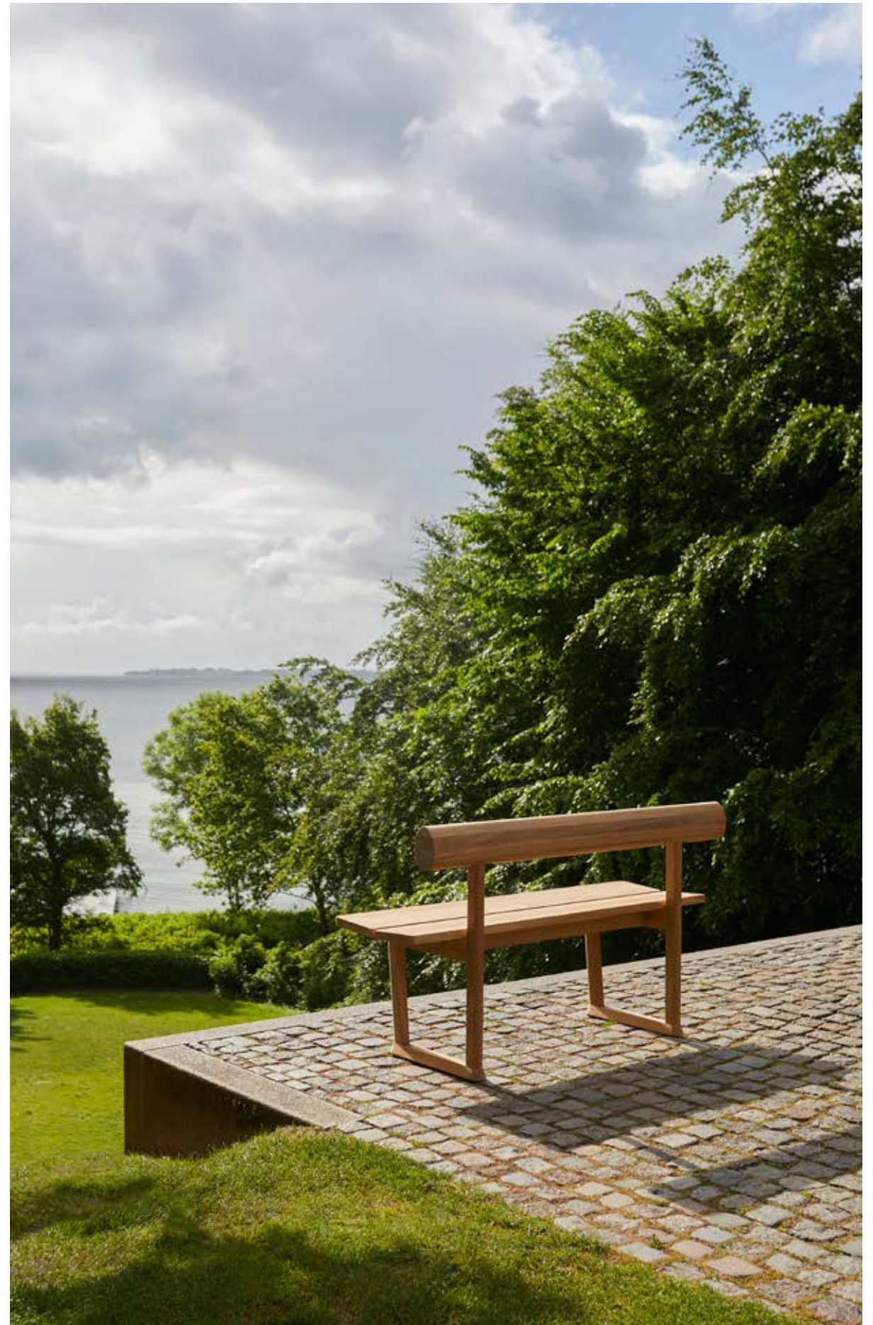
Banco Bench in teak