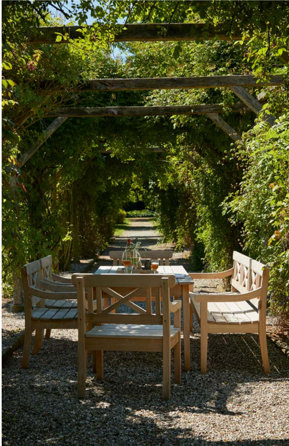
Drachmann Chair, Bench and Table in teak