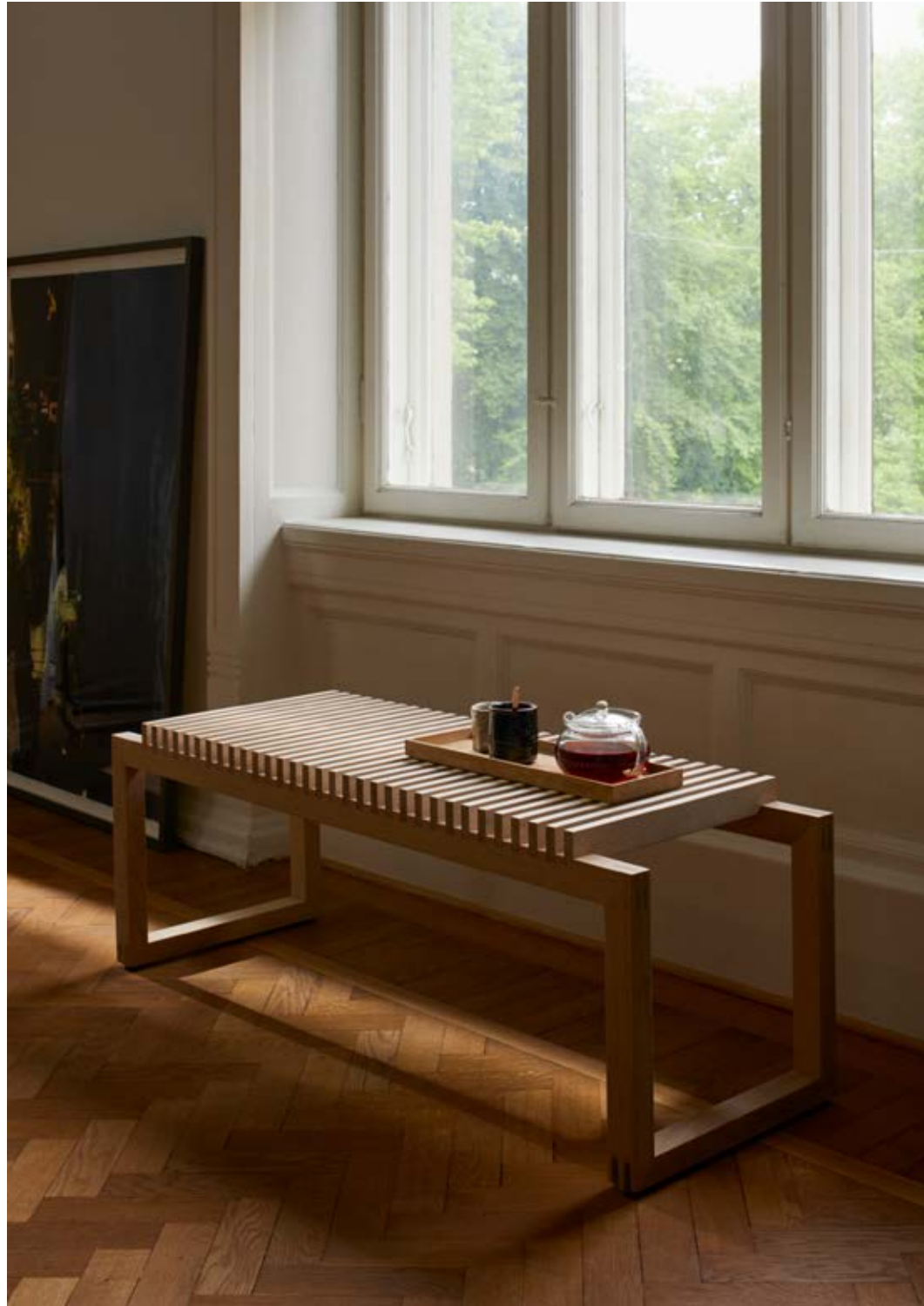
Cutter Bench and Nomad Tray in oak