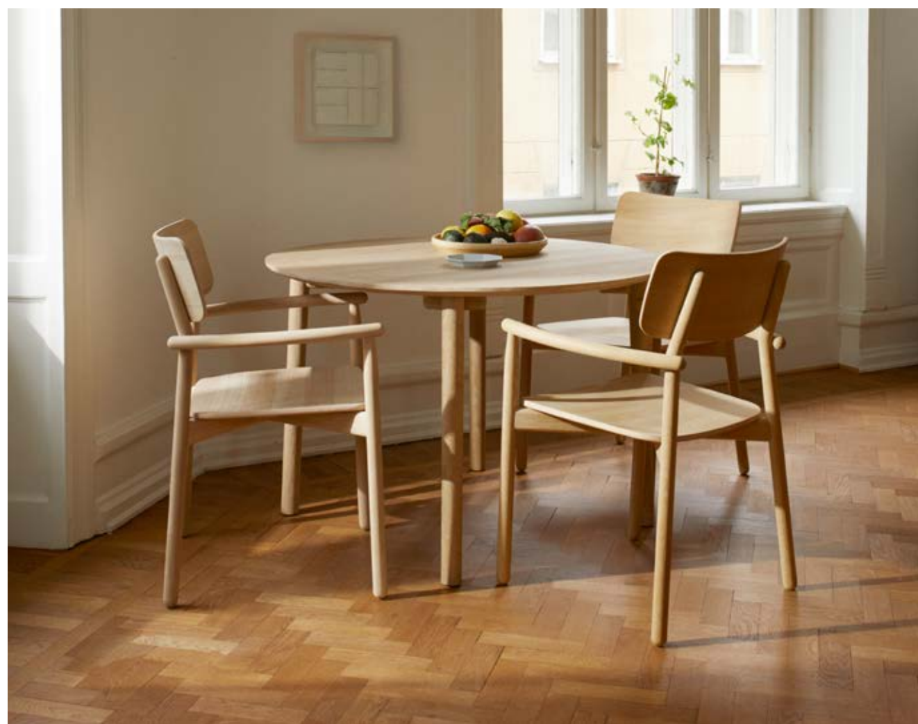
Hven Armchair and Table in oak

Hven is a collection of inviting and minimalist furniture with a natural Nordic look and feel. Hven is named after the Swedish island that lies in the strait between Denmark and Sweden. Designed in collaboration with contemporary Swedish designer, Anton Björnsing, the minimalistic collection is easy to mix with other furniture.