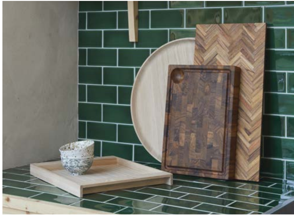
Dania and Sild Cutting Boards and No. 10 and Nordic Trays