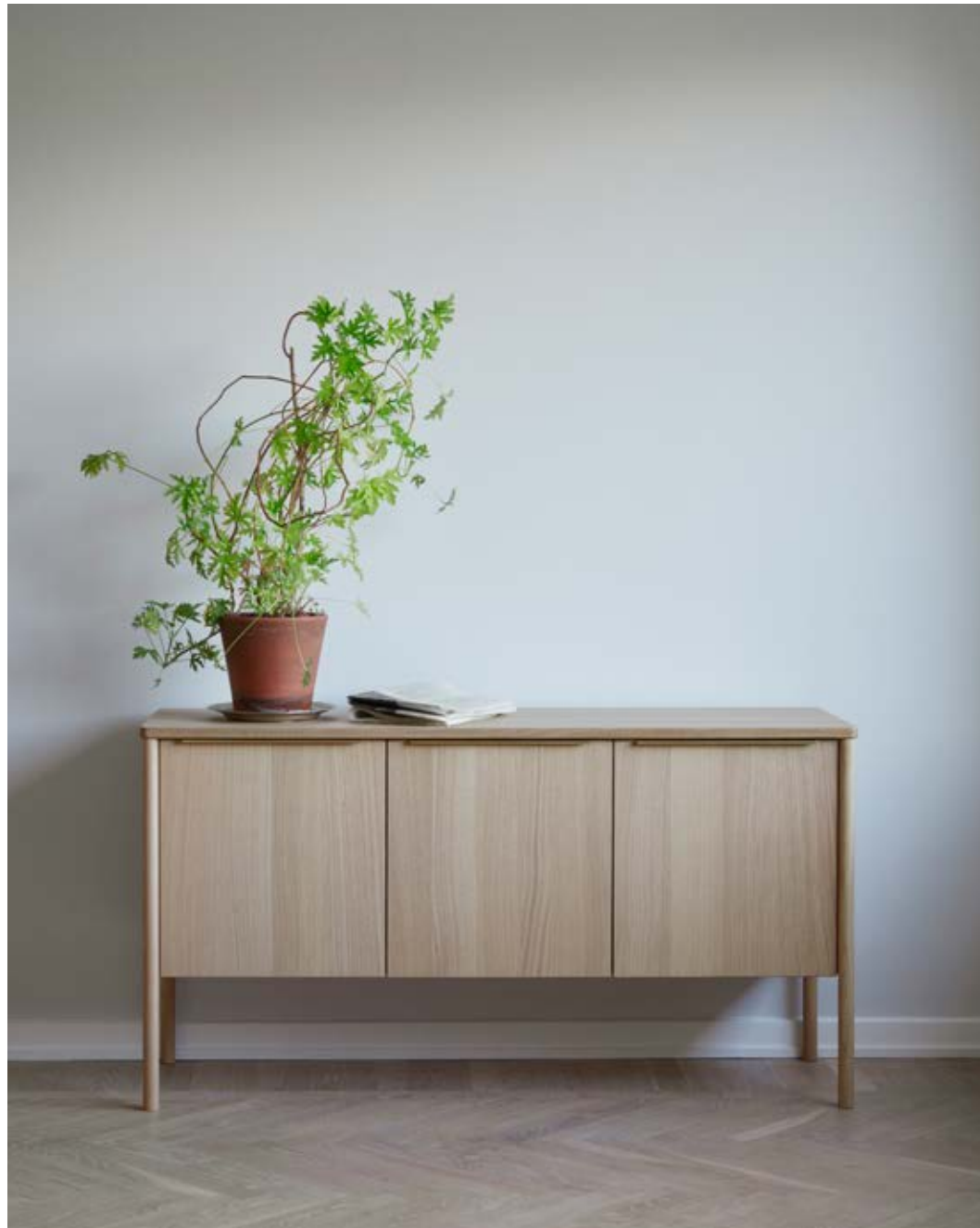
Jut Cabinet in oiled oak

Jut is a cabinet series that exudes a graceful contemporary expression. A practical storage piece, its slim legs and subtle curves underline the elegance of this modern piece of furniture. Designed in collaboration with Norway-based British designer, Thomas Jenkins.