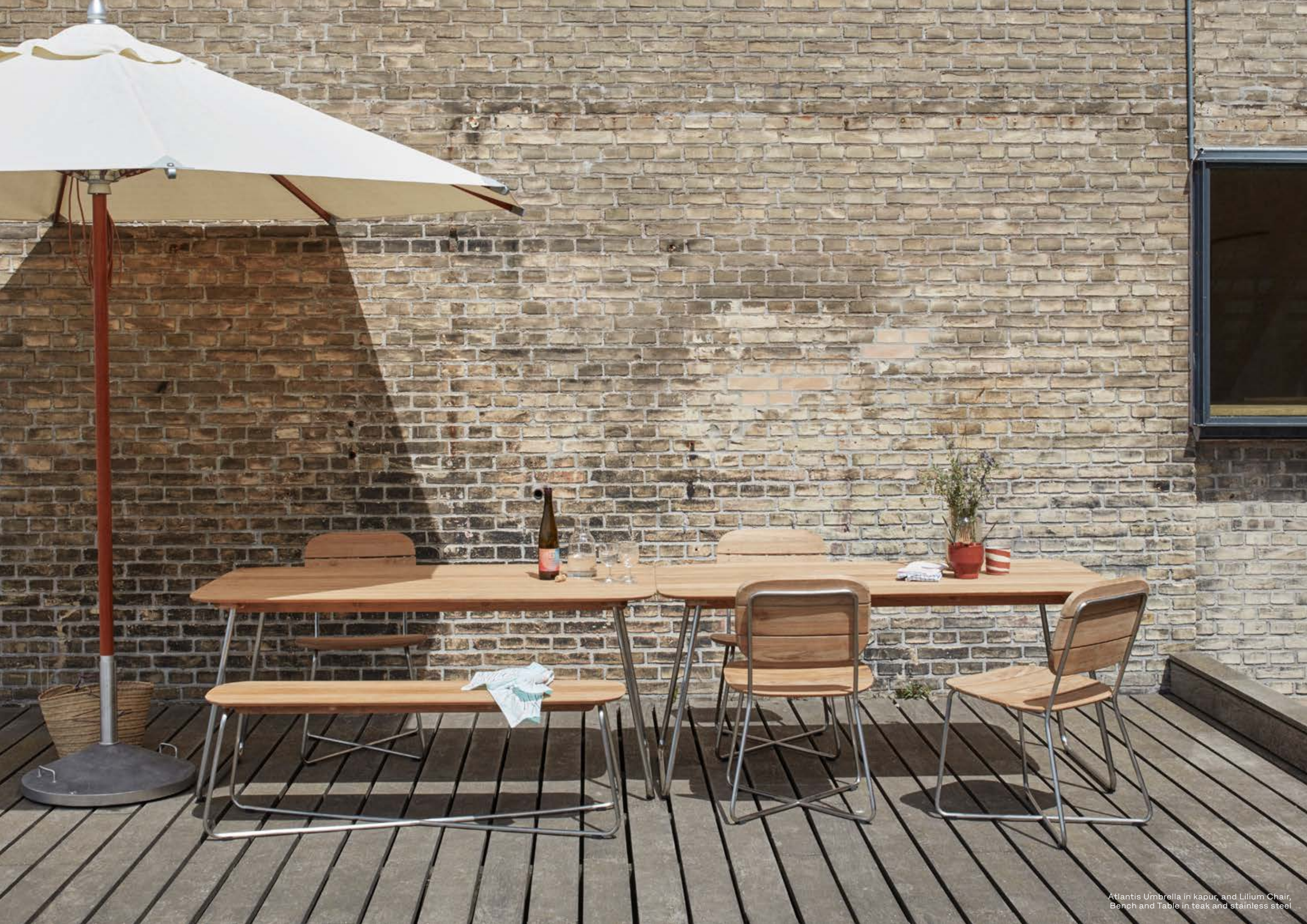
Atlantis Umbrella in kapur, and Lilium Chair, Bench and Table in teak and stainless steel