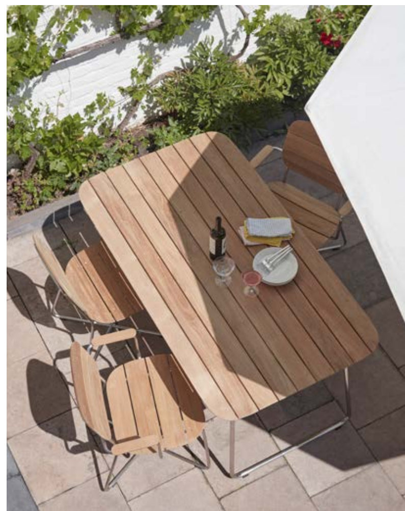
Lilium Chair and Table in teak and stainless steel