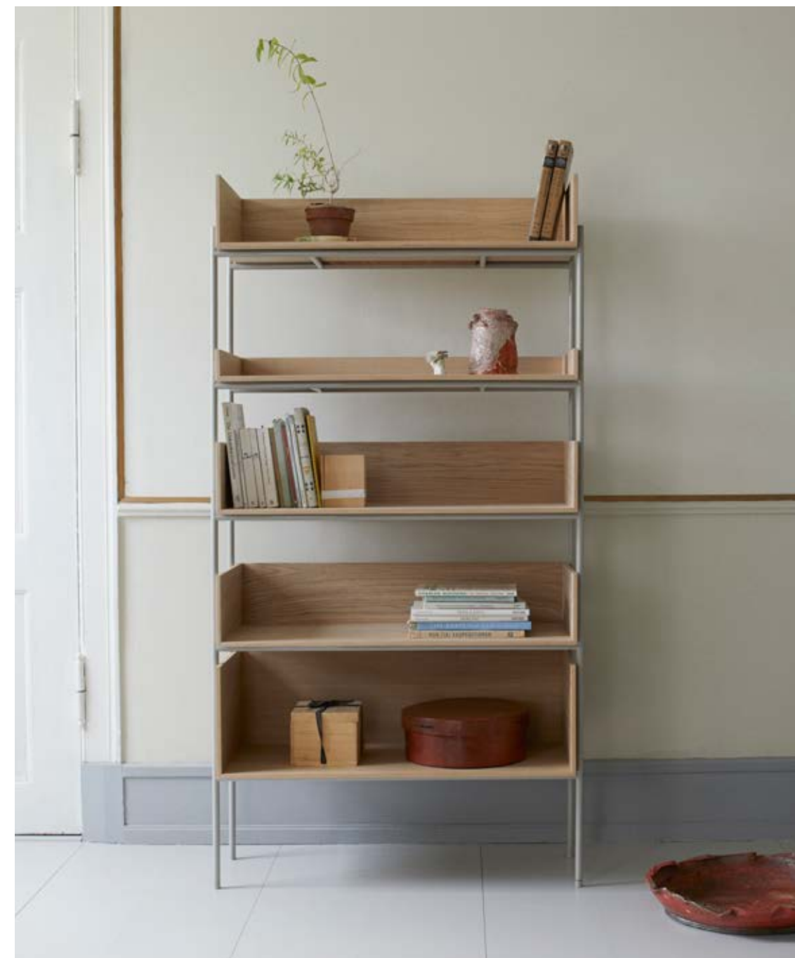
Vivlio Shelf in oak and Frame in Silk Grey steel