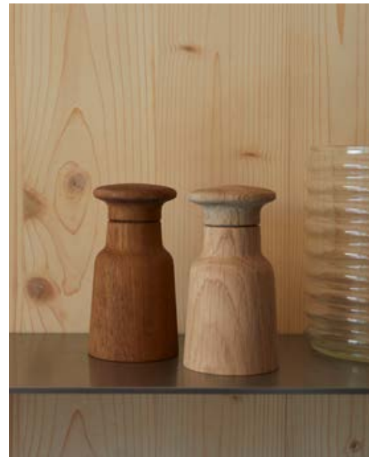
Hammer Grinder in oiled teak and oak