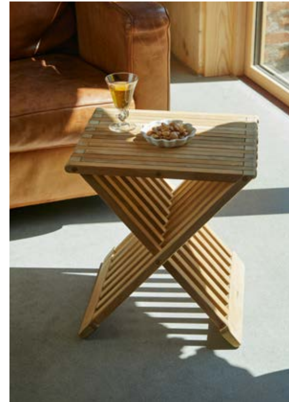
Fionia Stool in oak