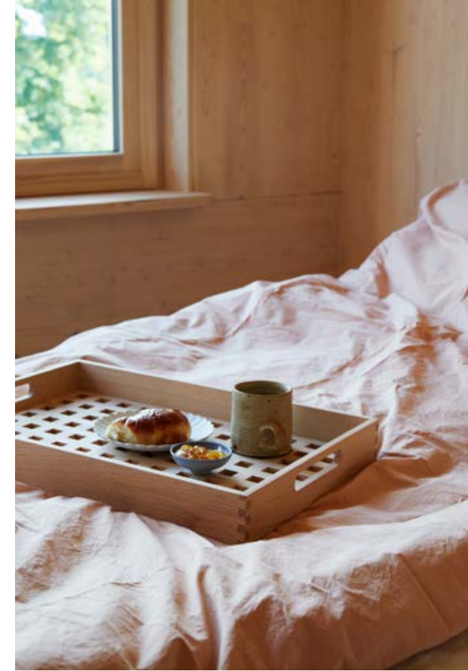
Fionia Tray in oak