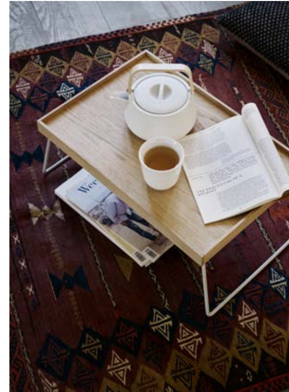
Nomad Table Tray in oak and steel