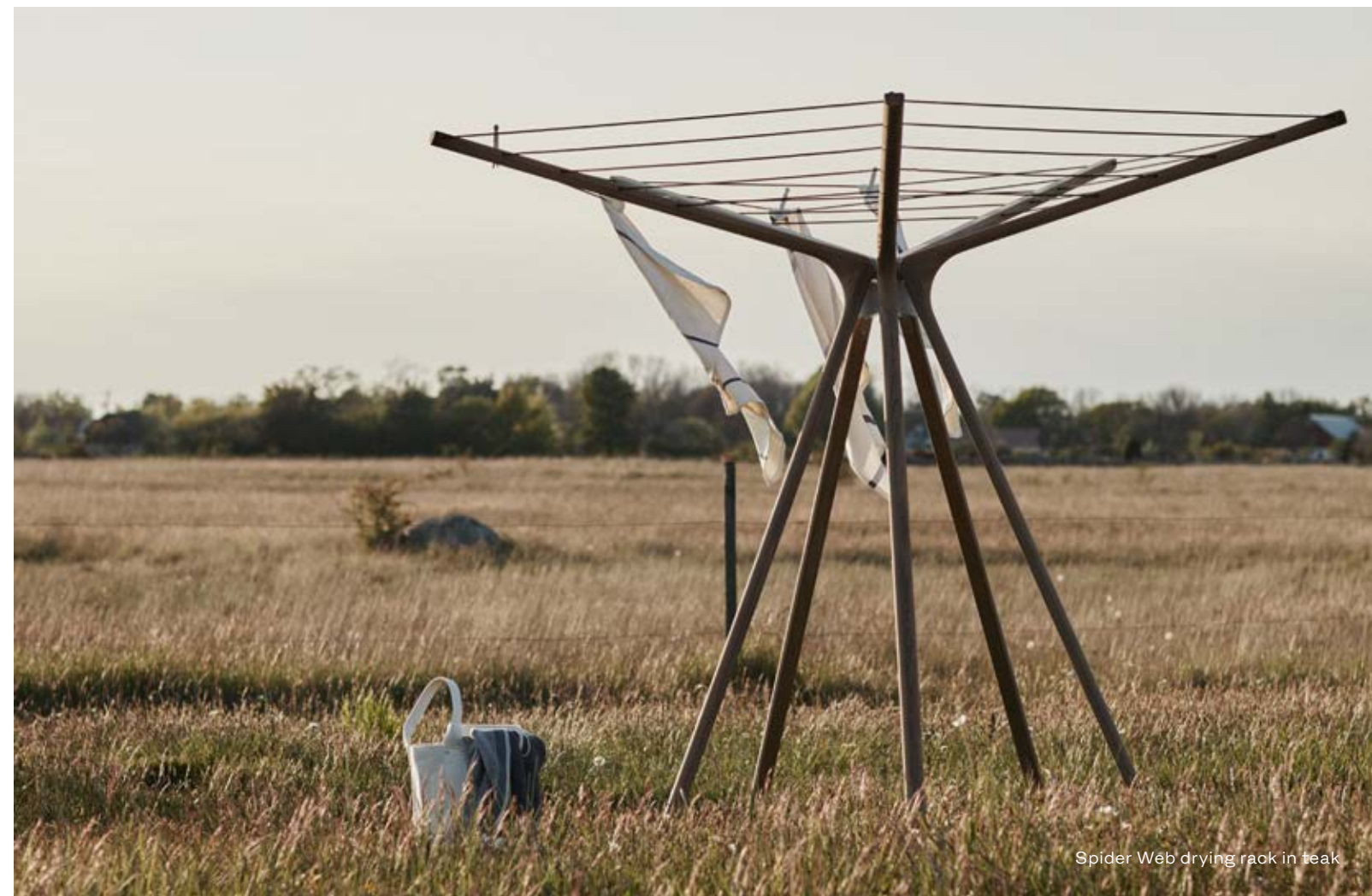
Spider Web drying rack in teak

Material choice and the possibility of repair are essential to ensuring longevity. Each piece is made with honest, durable materials that age beautifully. Responsible materials like FSC™-certified wood and certified textiles made without harmful chemicals are preferred and used in most pieces.