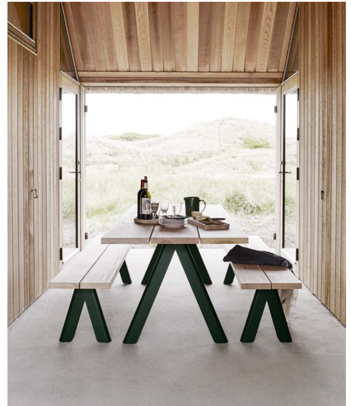
Overlap Bench and Table in Western Red Cedar

Overlap series stands strong on its overlapping steel legs. Thanks to the rustic wooden planks and the powder-coated steel, the collection has a modern edge and contemporary appeal. Perfect for both indoor and outdoor use. Overlap is designed in collaboration with Swedish architecture studio, TAF.