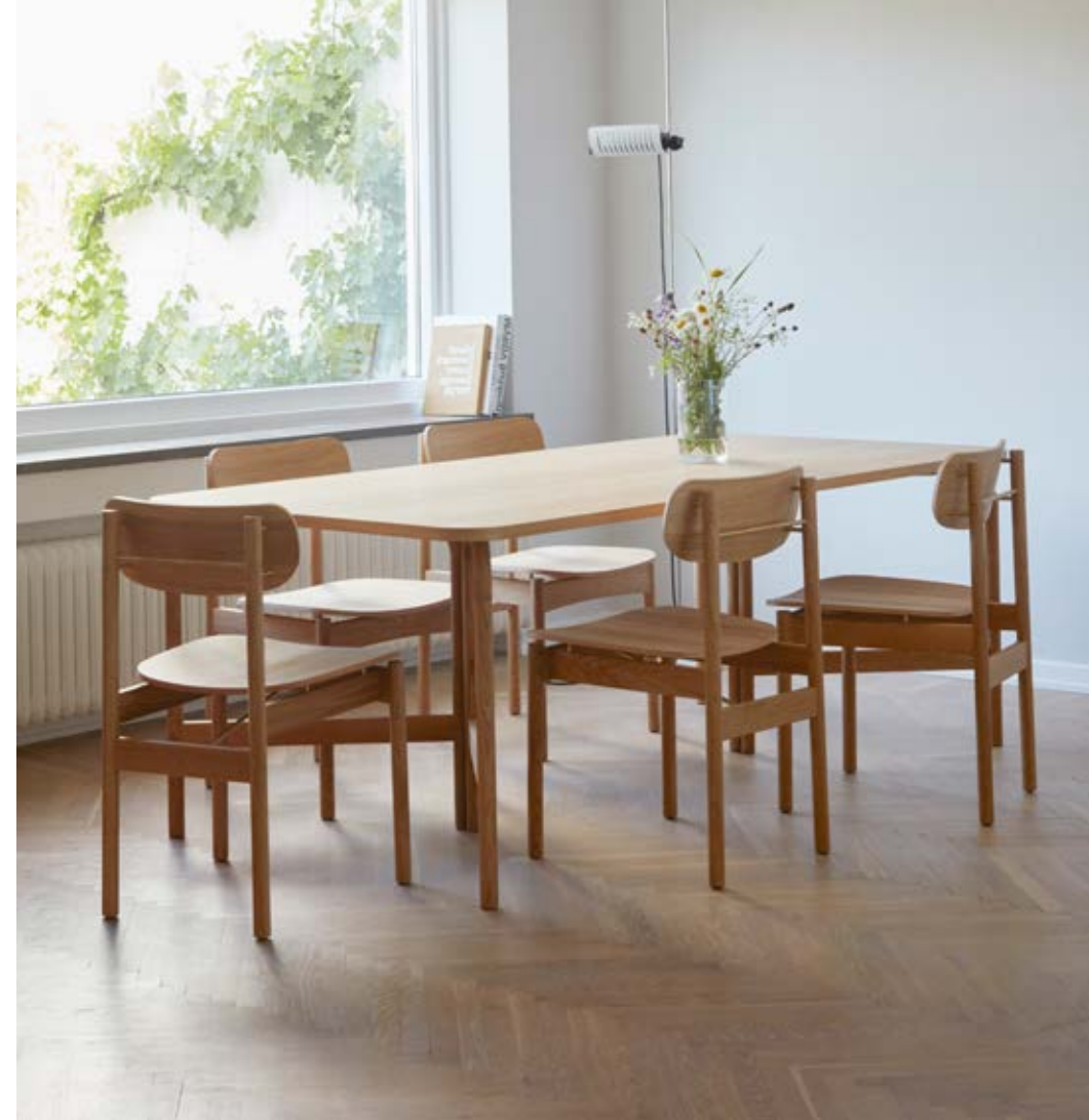
Vester Chair and Aldus Table in oiled oak