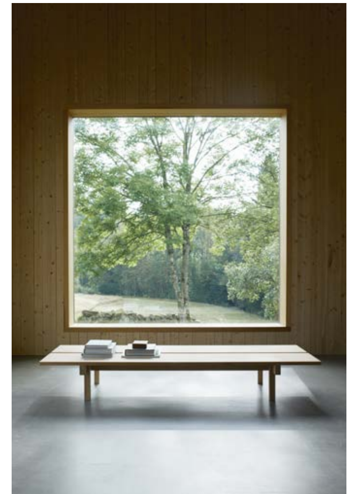
Reykjavik Daybed in Douglas Pine