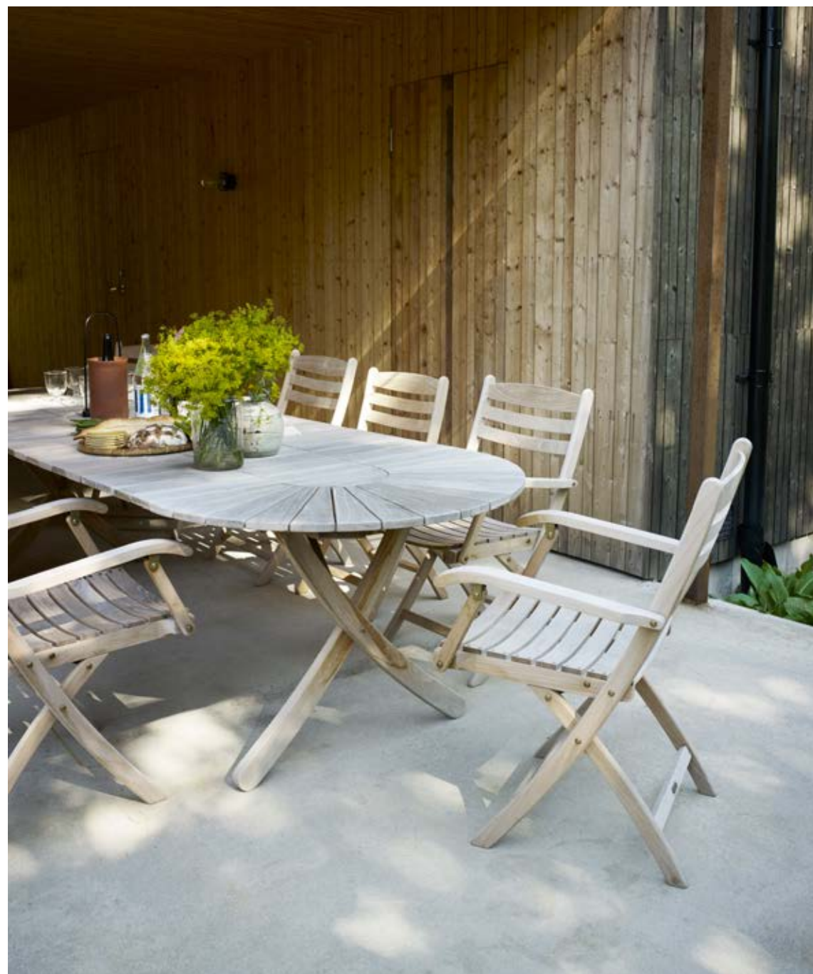
Selandia Armchair and Table in teak