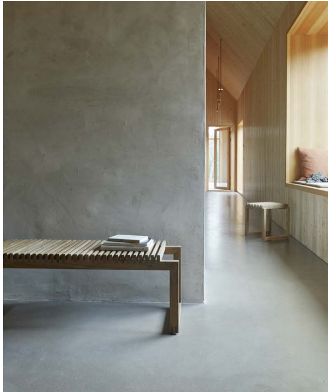
Cutter Bench and Stool in oak

The Cutter series by contemporary Danish designer Niels Hvass is minimalistic, functional and ideal for hallways. The collection contains a range of distinctive pieces that combine beauty and practical solutions for everyday needs.