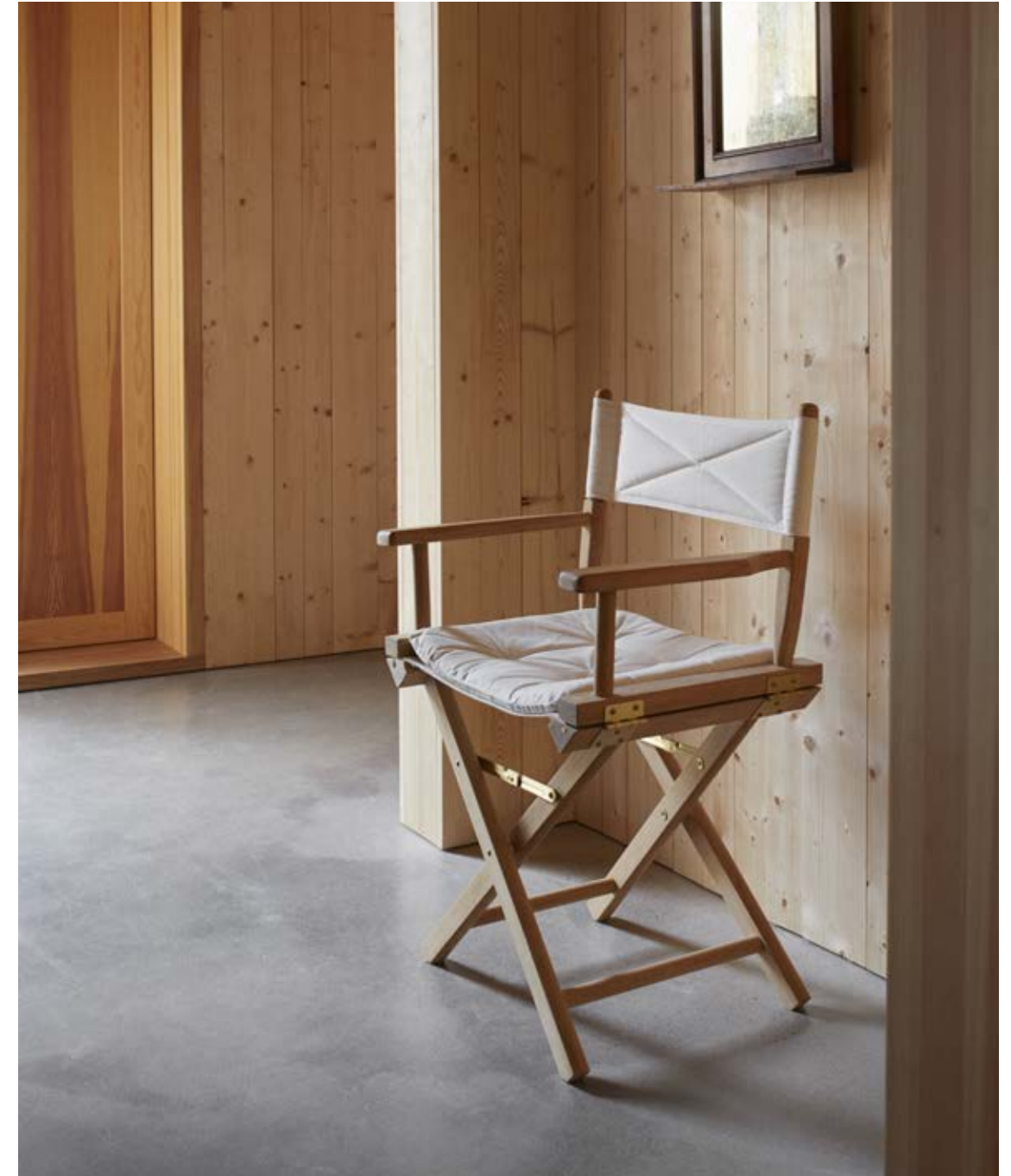
Director's Chair in teak and canvas