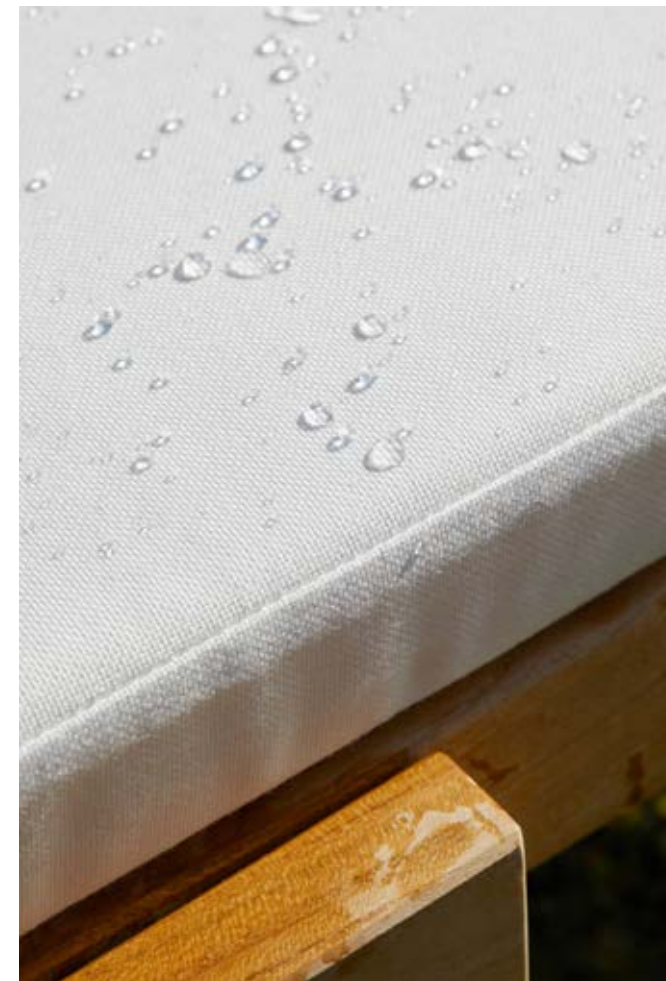
Cushion in water-repellant fabric