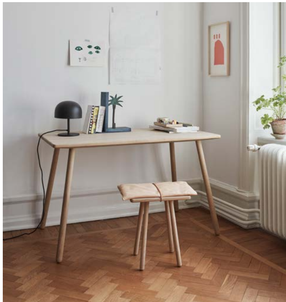
Georg Desk and Stool in oak