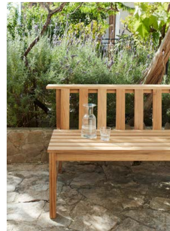
Plank Bench in teak

Plank outdoor series by contemporary Parisian designer Aurélien Barbry, is characterised by simplicity and functional beauty. An architectural repetition lends the Plank series a clean and modern elegance.