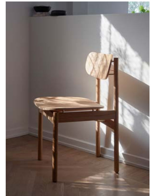
Vester Chair in oiled oak